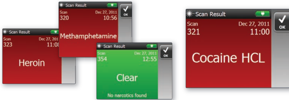
A sample of the narcotics identifiable using the TruNarc analyzer, and a clear result where no narcotics were identified.

Once a substance is analyzed, full results are automatically captured for reporting and evidence. Rapid results combined with automated reports can streamline the path to prosecution, reducing administrative burden and dramatically impacting the time and expense of drug-related arrests.